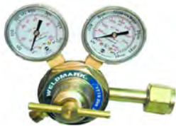
25 SERIES MED. DUTY REGULATORS