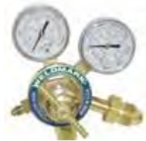
500 PSI NITROGEN HVAC