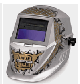
MILLERMATIC # 231406