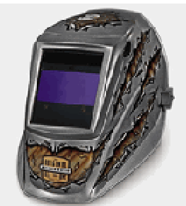
MILLERMATIC II # 232037