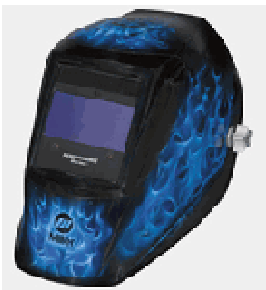
BLUE RAGE # 241458

*** FREE 2 ND DAY AIR SHIPPING DIRECT FROM MILLER ON ALL HELMETS