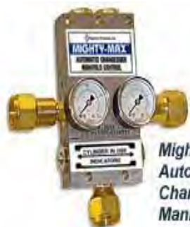
Mighty-Max Automatic Changeover Manifold