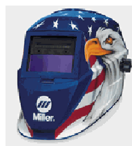
AMERICAN EAGLE II # 231405