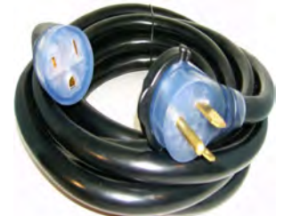
83 Welding Machine Extension Cords, 25 Ft. and 50 Ft.