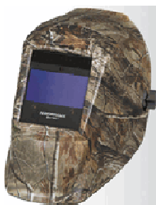
CAMO # 241460