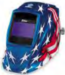
STARS & STRIPES II